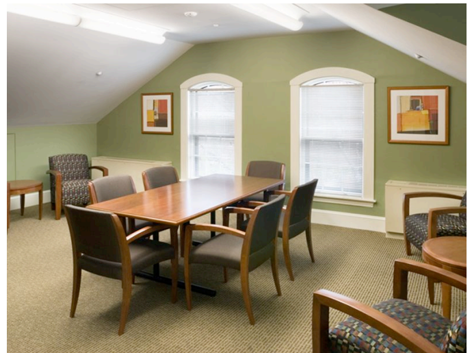
Conference room and lounge for Petrie-Flom Center