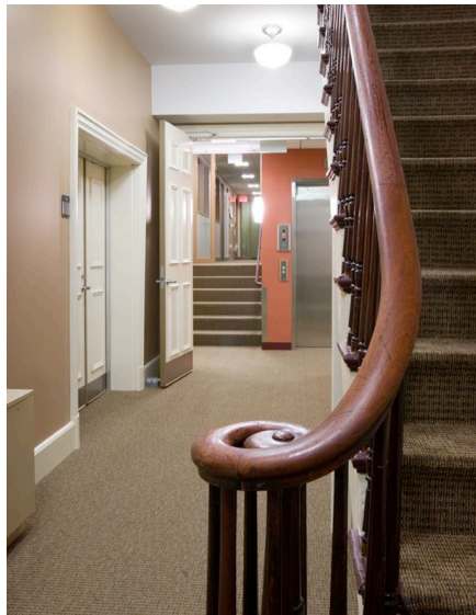
Stair at first floor looking to addition

complex Cambridge zoning regulations, and received approval by the Cambridge Historical Commission.