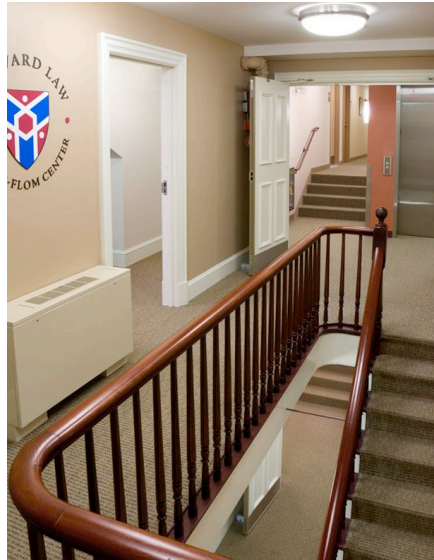
Main stair at third floor