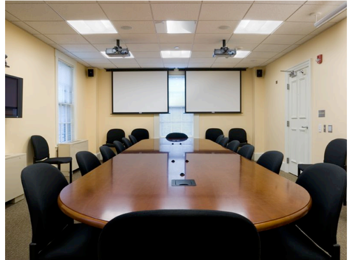
Videoconference room for Berkman Center